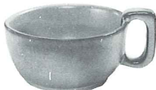
4SC—5" CUP-BOWL 4.00