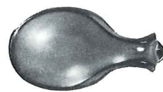
* 4Y 3.50