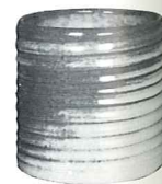
272—4" RINGED CYLINDER VASE 3.30