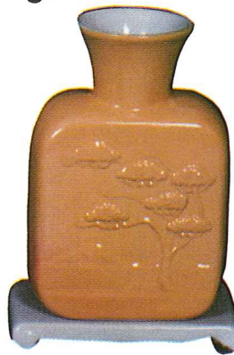
* V-14—Peach/Mtn. Haze 25.00