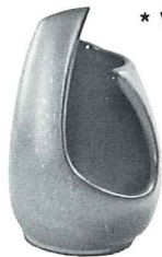
302—6" CANDLE VASE 5.00