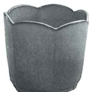
37—4" HEXAGONAL PLANTER 3.30