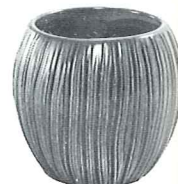
T7—3½" COCONUT PLANTER 2.80