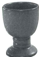
26LC—4½" 6 OZ. TUMBLER VASE 3.50