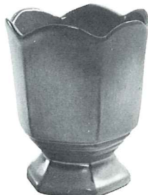
65—6½" HEXAGONAL VASE 6.50