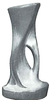
95—8½" FREE FORM VASE 6.50