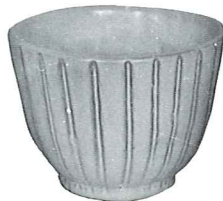
176—4" PLANTER 4.00