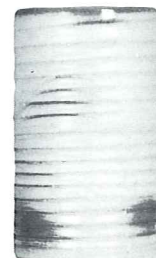
172—6½" RINGED CYLINDER VASE 5.00