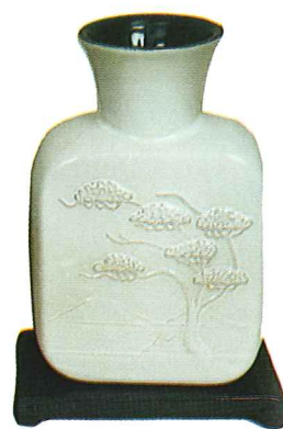
* V-14—WHITE/NAVY BLUE 25.00