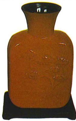
* V-14—FLAME/BLACK 25.00