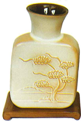
* V-14—DESERT GOLD/COFFEE 25.00