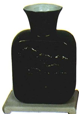
* V-14—BLACK/WHITE 25.00