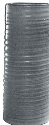
72—10" RINGED CYLINDER VASE 7.00