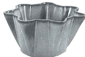
F33—3¾x7" FLUTED PLANTER 6.00