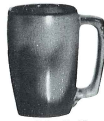
5M—5½" 16 OZ. MUG 5.00