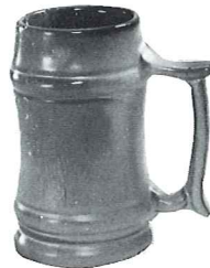
M2—6" 18 OZ. MUG 5.00