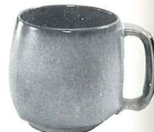
4M—4½" 18 OZ. MUG 5.00